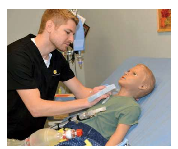
Figure 2. Pediatric home service simulation lab. Note. Pediatric Home Service, Roseville, Minnesota,

are underway to promote this training method (Boroughs, 2017; Thrasher et al., 2018).