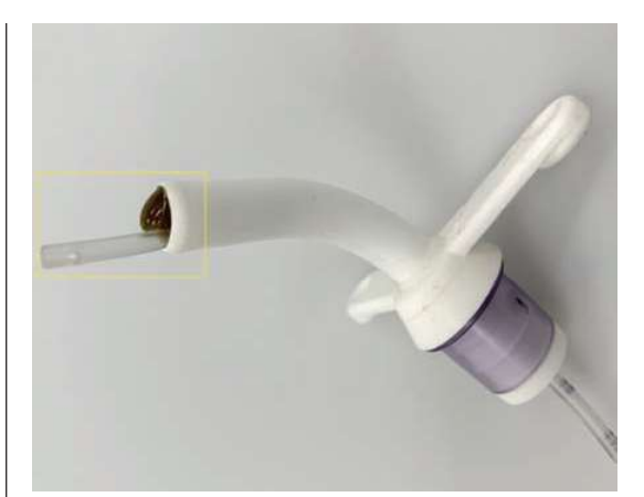
Figure 2. Catheter pushed through plug. The suction catheter passes through the mucous plug, but the plug is not removed during the return suction. Pediatric Home Service. (2019). Roseville, Minnesota.

John is a tracheostomized and ventilatordependent 14-year-old with Duchenne muscular