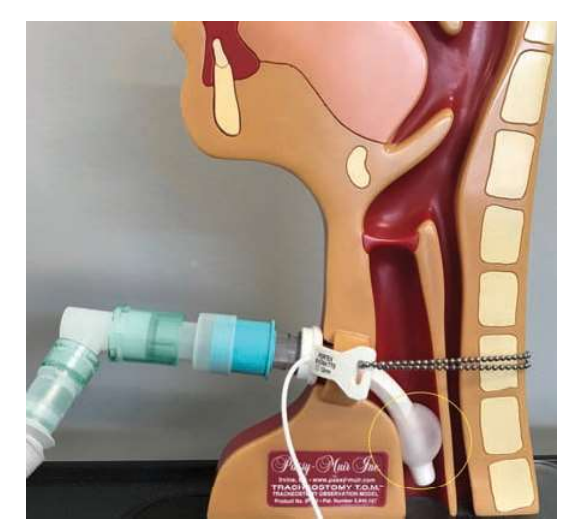
Figure 5. Speaking valve with inflated cuff. A patient cannot exhale through the uppper airway with the cuff inflated and speaking valve in place. Pediatric Home Service. (2019). Roseville, Minnesota.

allows airflow thru the tracheostomy tube during inspiration. During expiration, airflow bypasses the tracheostomy tube and is directed through the upper airway and larynx to allow vocalization. Failure to deflate the cuff on a tracheostomy tube before use of a speaking valve causes air trapping and respiratory distress. Always review safety protocols prior to using a speaking valve.