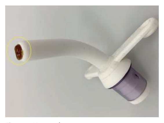
Figure 3. Mucous plug returns. Mucous plug continues to occlude the inner lumen of the tracheostomy tube after the suction catheter has been withdrawn. Pediatric Home Service. (2019). Roseville, Minnesota.

dystrophy. He begins developing respiratory distress characteristic of his need for airway suctioning. After two passes of the suction catheter to a safe suction depth of 1 cm beyond the distal tip of the tracheostomy tube, scant amounts of mucus are aspirated, but his distress continues. The patient remains in distress despite minimal lavage, ventilating with a resuscitation bag and oxygen, and repeat suctioning. Performing an emergency tracheostomy tube change resolves the situation. The patient is stabilized after the emergency tracheostomy tube change and placed back on the home ventilator.