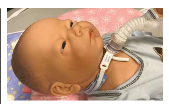
Figure 6. Decannulation exposed. Clothing, dressings, and other items must be moved to visually verify proper tracheostomy tube position. Pediatric Home Service. (2019). Roseville, Minnesota.

The tracheostomy tube flange, connector, and tracheostomy ties may appear to be in the correct position. However, this can be misleading and it