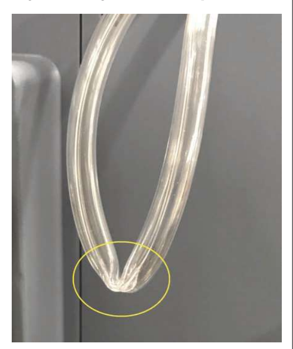
Figure 4. Kinked oxygen tube. Tubing must be free of kinks.

Mary is a tracheostomized and ventilator-dependent 8-year-old with type 1 spinal muscular atrophy. She receives supplemental oxygen titrated at 1–2 liters per minute through the back of the ventilator to maintain oxygen saturations at 92% or greater. During her routine transport to school,